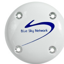
Single Element Iridium Antenna

SkyLink 7100 Gateway can integrate with COTS, LTE, or MIMO antennas.